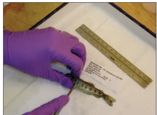
Preparing fish for histological examination