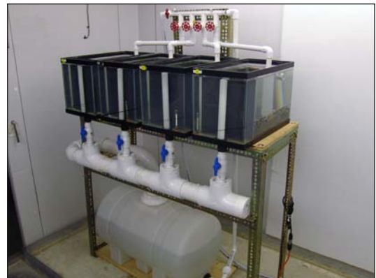
Experimental snail system