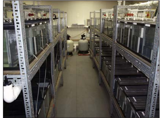
Tanks for holding small fish

http://watercenter.montana.edu/aquaticlab